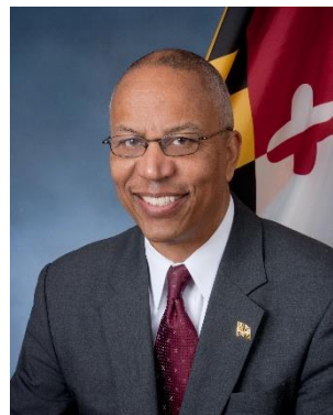
Boyd K. Rutherford Lt. Governor