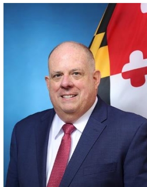
Larry Hogan Governor